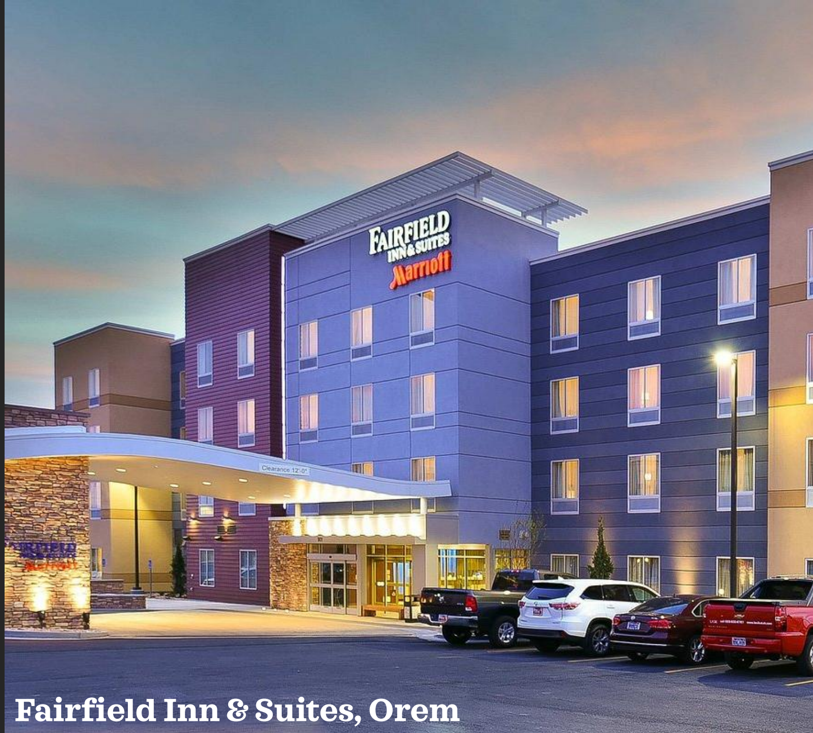
Fairfield Inn & Suites, Orem