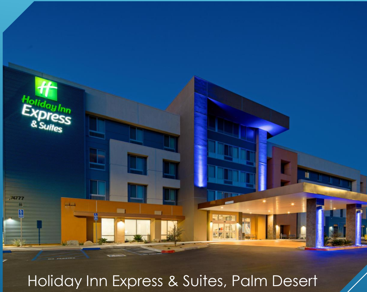
Holiday Inn Express & Suites, Palm Desert